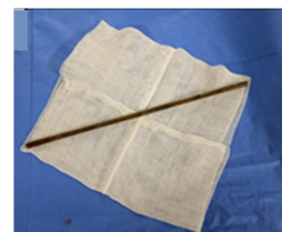
Figure 4. Iron bar removed by surgery.

The patient was then admitted to the intensive care unit. Postoperatively, a large spectrum antimicrobial therapy in intravenous route (ceftriaxone 2g q 24h for 10 days, metronidazole 200mg q 8h for 10 days and gentamycin 80 mg q 24 h for 5 days) was administered because of the high risk of intracranial septic complications. Prophylaxis for seizures (sodium valproate 200mg q 8h for 1 month) and tetanus (antitetanus immunoglobulin and antitetanus vaccine) were administered. On the second postoperative day, control CT was done in order to look for intracranial hematoma. CT has revealed a cerebral edematous and hemorrhagic contusion in the line of the wound track (shown in Figure 5.).