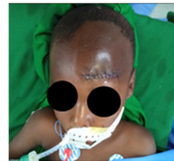
Figure 3. Post-operative anterior view showing the suture of the operative wound.